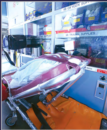
Storage trays or equipment drawers