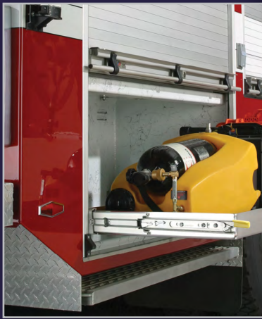
Equipment platforms or pull-outs