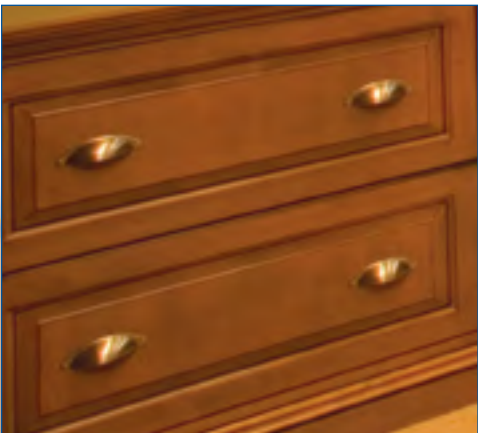
Residential furniture and cabinetry