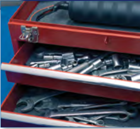
Tool and equipment storage