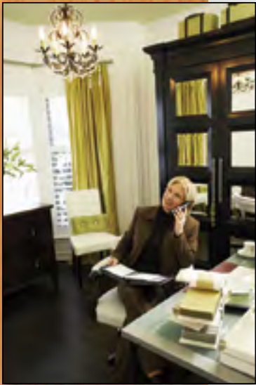
Business and Home Office