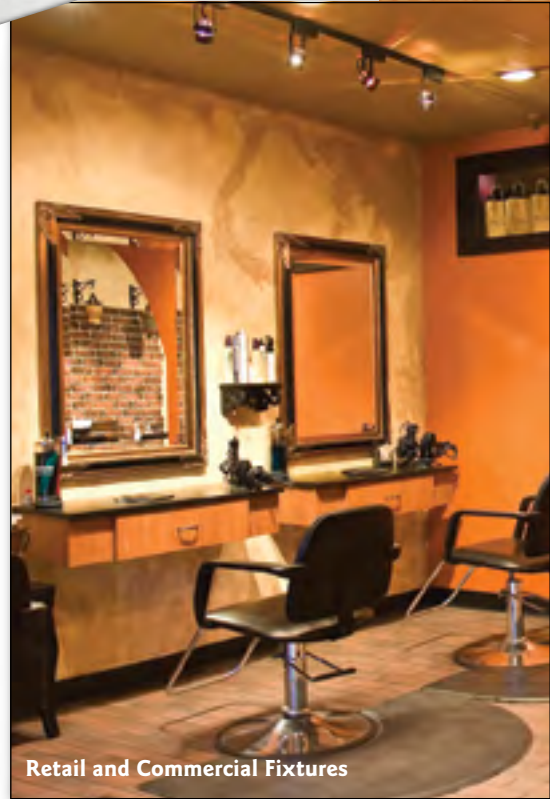
Retail and Commercial Fixtures