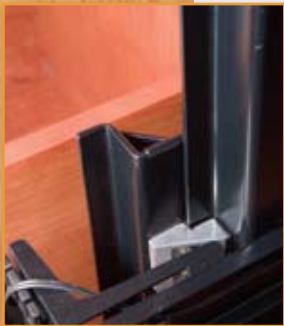
Reinforced Steel Rails