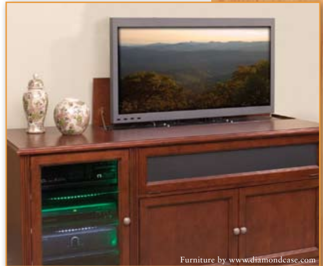
Furniture by www.diamondcase.com