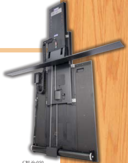
CBLift-050 Quick Lift