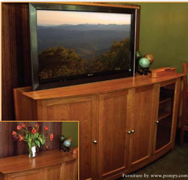
Furniture by www.pompy.com