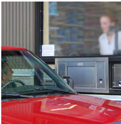
A good solution for partitioned indoor/outdoor access.