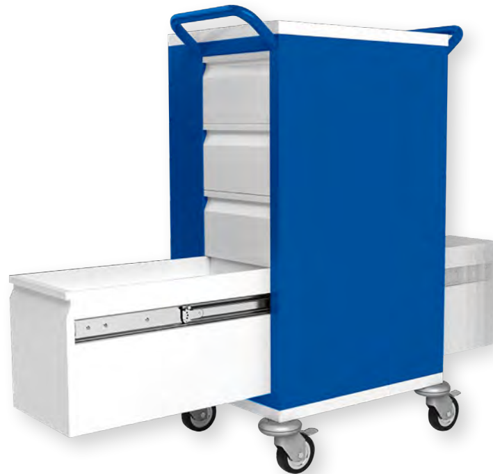
Expands access in mobile supply carts.