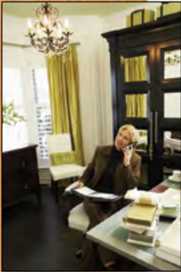
Business and Home Office