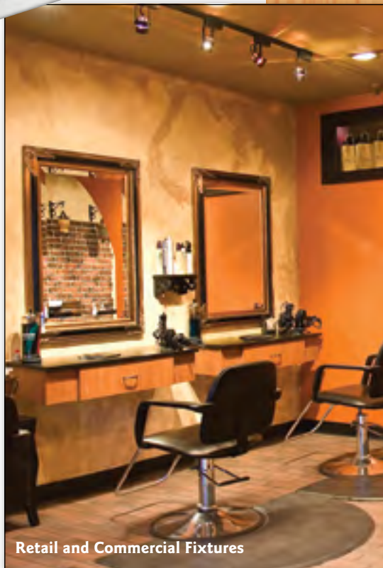
Retail and Commercial Fixtures