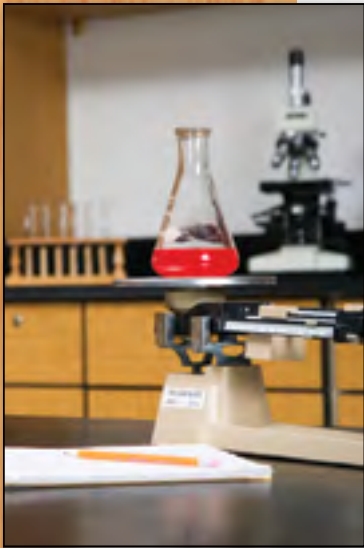
Tested to meet SEFA laboratory casework standards.