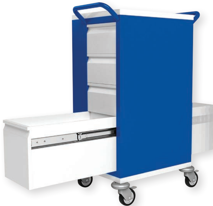
Expands access in mobile supply carts.